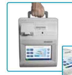
Portable and lightweight