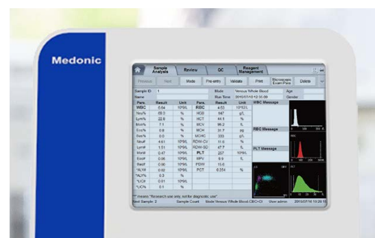
Robust software ensures reliable data generation and storage.

Medonic M51 provides accurate test results from small sample volumes. Reliable instrument performance is accomplished by stringent material selection and intelligent design of system components. A variety of connection options facilitate communication and exchange of data between laboratories.