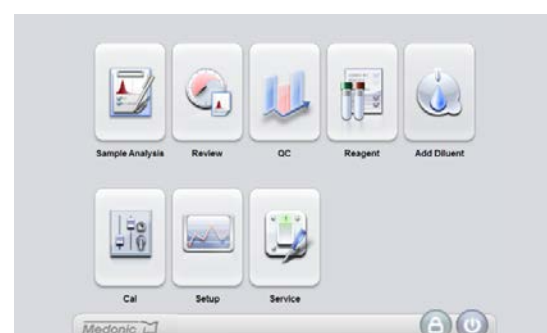
Easy-to-use display simplifies system handling.

Medonic M51 is designed to simplify work processes and give users better control of sample results and patient records. The intuitive user interface promotes smooth operation, with simple-to-understand and easy-to-navigate menus. Instrument features such as the open probe design and the selected leaning angle of the screen contribute to a comfortable working environment.