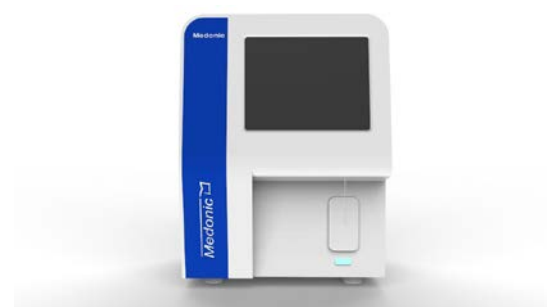
A compact design makes the system suitable for confined spaces.

Medonic M51 provides you the possibility to leverage high-quality diagnostics, while keeping costs to a minimum.